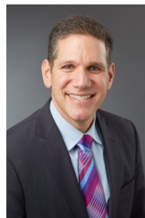
Lawrence "Larry" D. Sloan

The full press release can be found on the AIHA website at: https://www.aiha.org/about-aiha/Press/2016PressReleases/Pages/AIHA-Board-Names-Lawrence-D.-Sloan,-CAE-as-Next-CEO.aspx